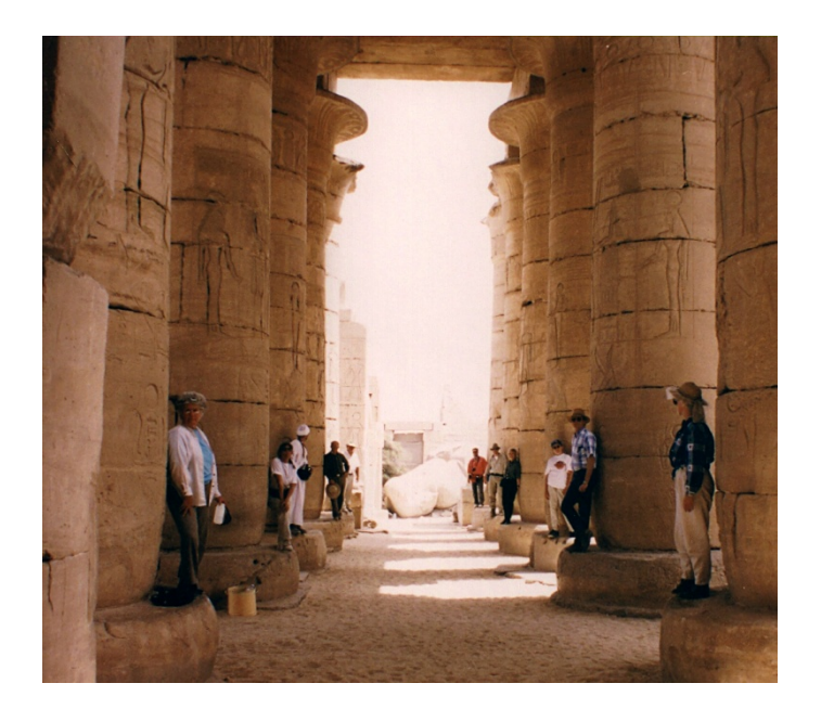
The Karnak Temple, Egypt