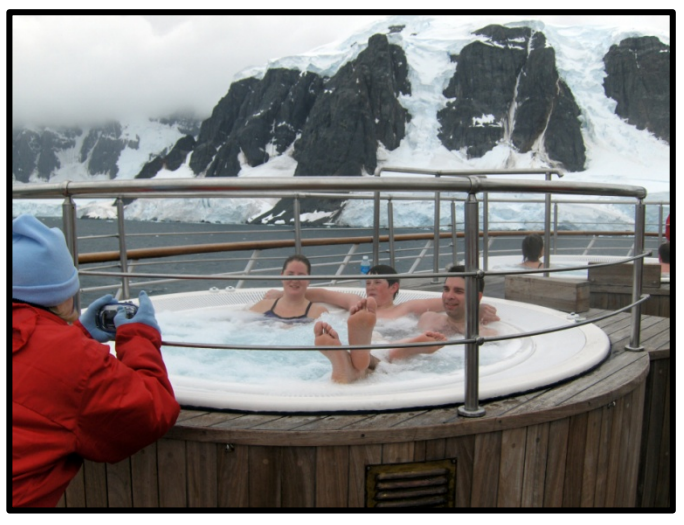
Near the Antarctica Peninsula