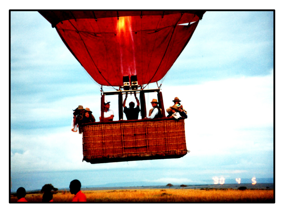
Balloon trip over the Masai Mara, Kenya