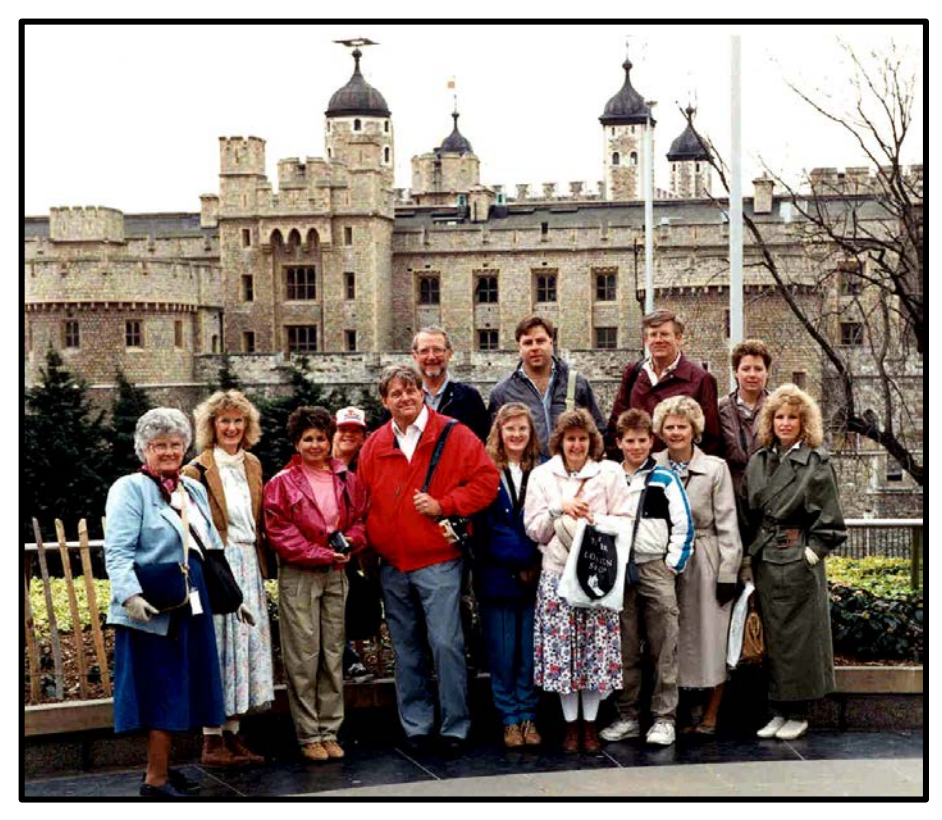
At the Tower of London