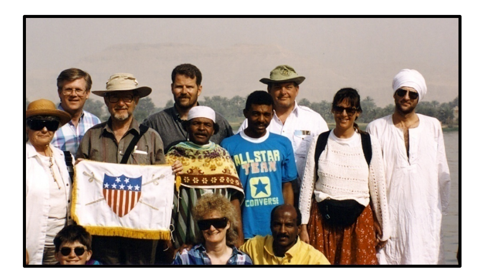
On the Nile with Felucca Staff (the one on the right is the Astronaut)