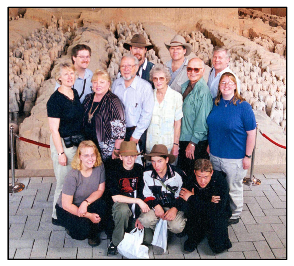
With the Terracotta Warriors in Xian, China