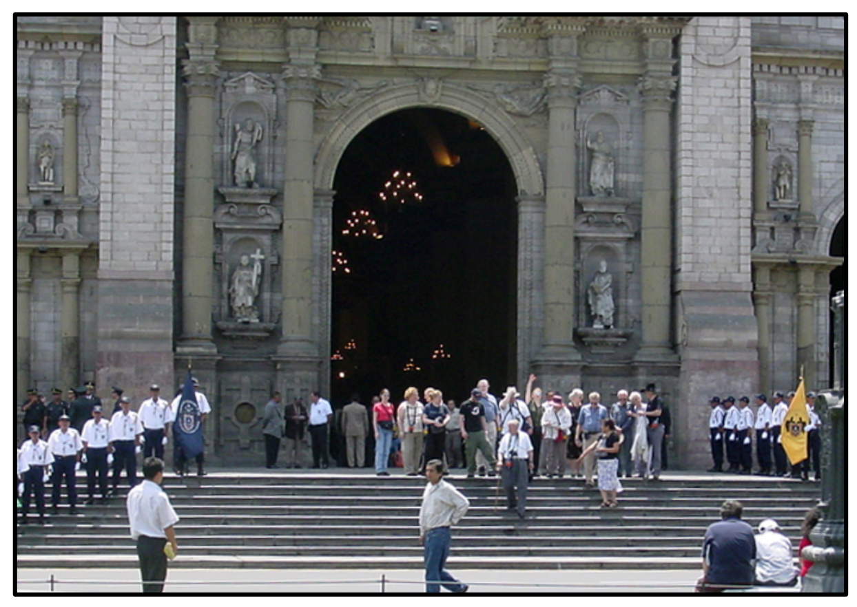
At the Door of the Cathedral, Lima, Peru