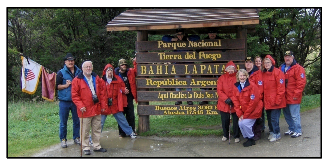
Tierra del Fuego, Argentina